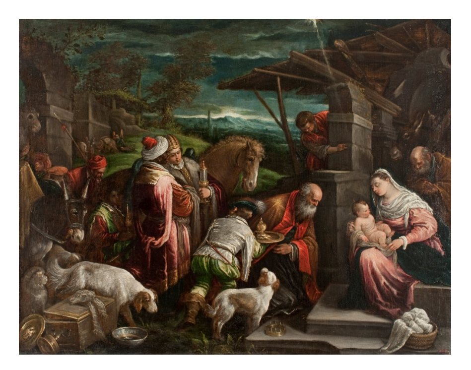
Picture 3. Jacopo Bassano & Leandro Bassano (1580). The Adoration of the Magi