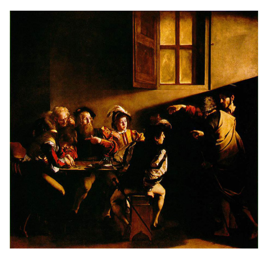
Picture 1. Michelangello Merisi da Caravaggio (1605). The Calling of St. Mathew